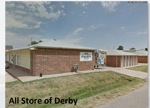
All Store of Derby