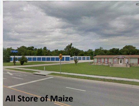
All Store of Maize