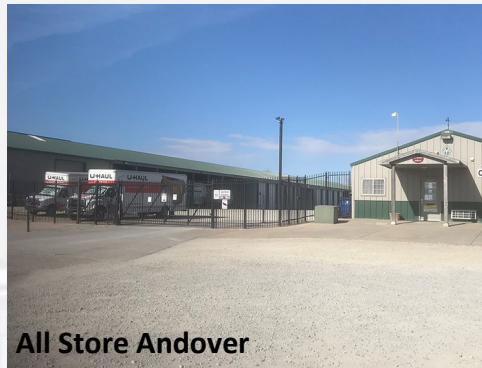
All Store Andover