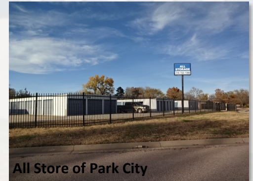
All Store of Park City